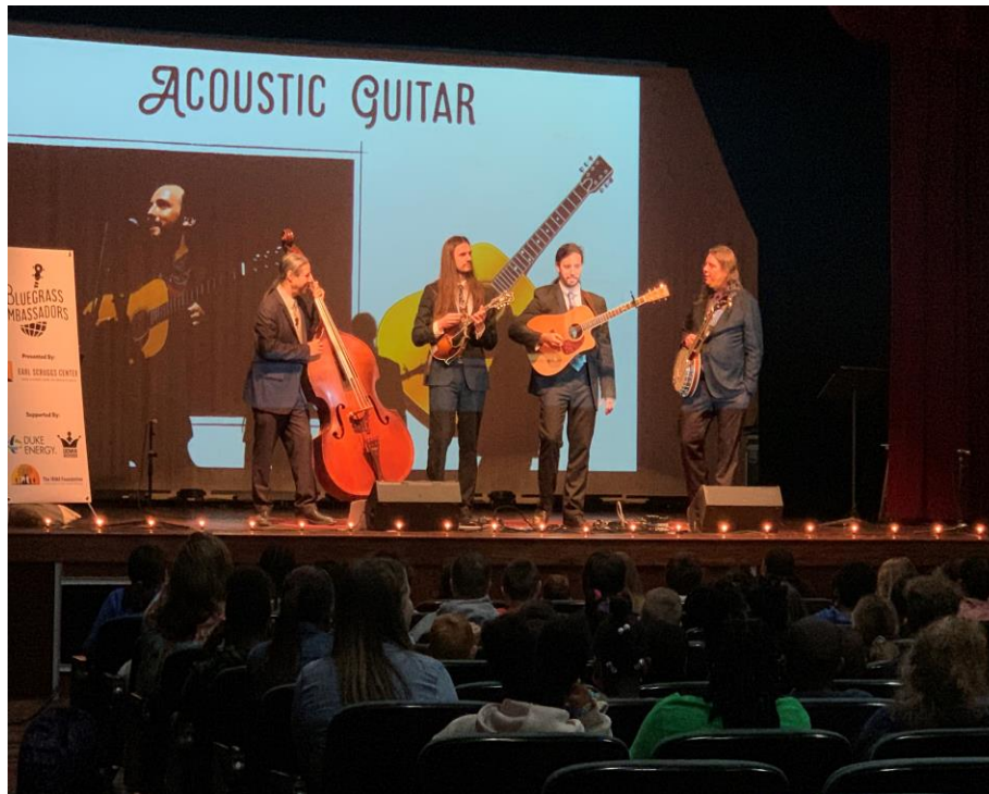
Photo below: The Bluegrass Ambassadors, the nonprofit arm of the Henhouse Prowlers, came to Shelby, NC, to present educational programs to all Cleveland County 4 th graders as a part of the Earl Scruggs Center's "Roots & Strings" program. Over four days they taught over 1,000 students about the roots of bluegrass and other music important to regional culture and history.

The Foundation awarded $20,334 in project grants in 2022 to the following groups: