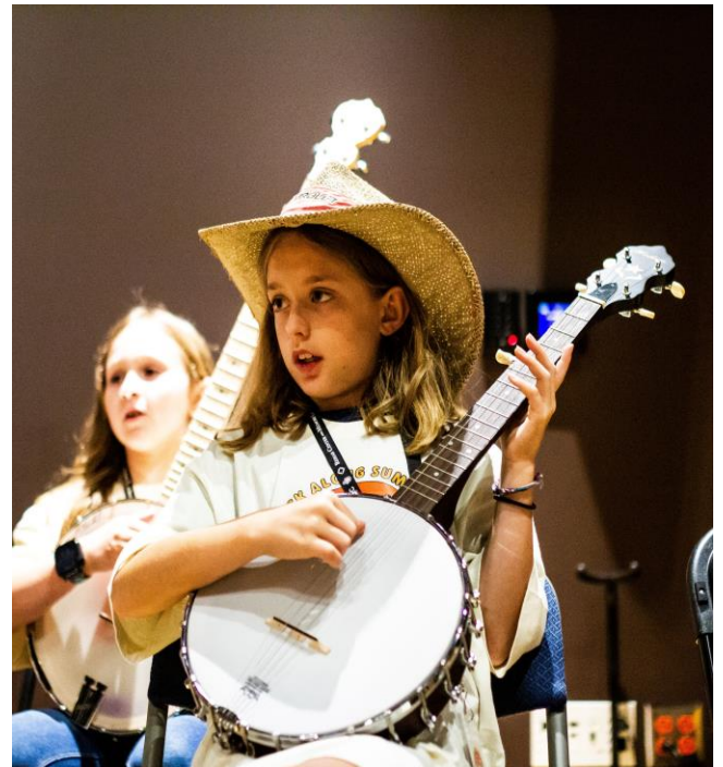
Photos above: Students learn to play bluegrass music at the Bluegrass Jam Camp in Sisters, Oregon, funded in part by an IBMA Foundation project grant.

Restricted Funds: At June 30, 2022, restricted fund balances included: Arnold Shultz Fund ( $58,454 ), Rick Lang Songwriter Scholarship Fund ( $45,973 ), Richard Barnhart Memorial Fund ( $27,722 ), Fletcher Bright Memorial Fund for Young Musicians ( $27,535 ), Sally Ann Forrester Scholarship Fund ( $21,706 ), J. D. Crowe Banjo Scholarship Fund ( $17,878 ), IBMA Scholarship Fund ( $16,338 ), Katy Daley Media & Sound Engineering Scholarship Fund ( $11,843 ), Bluegrass Stagecraft 101 Fund ( $5,000 ), and Neil Rosenberg Scholarship Award Fund: ( $200 ).