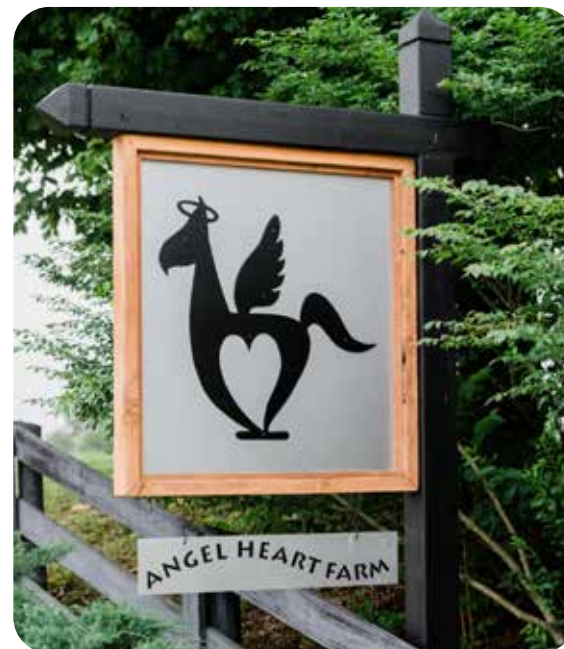
Angel Heart Farm’s sign is a reminder of what the farm is all about — healing, heart, and horses! The farm is located in College Grove, Tenn.